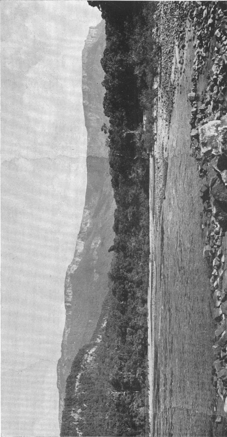
Fig. 1. Mt. Guaiquinima, looking east from Guaiquinima Falls on the Paragua River.