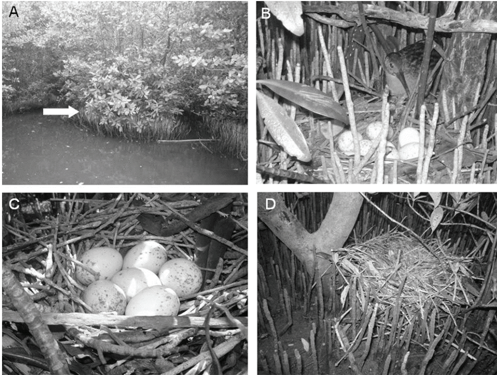
FIG. 2. Nests of Plain-flanked Rail found at Morrocoy National Park, western Venezuela, in May 2012. A) Nesting habitat, arrow indicates specific location of first nest found. B) Seven-egg nest with incubating adult. C) Active nest with a clutch of six eggs. D) Empty nest found at the base of a black mangrove ( Avicennia germinans ) tree.

for the Water Rail ( R. aquaticus ) in Britain and Ireland (Jenkins 1999). Since nests were checked only once there is the possibility that the six-egg clutch may have been incomplete (i.e., additional eggs may have been laid after our visit).